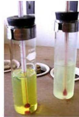
Cloud Point Analysis and two cloud point vials showing cloud point on the right.