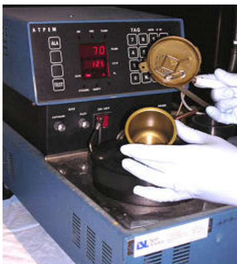
Flash Point Testing

There is a flash point waiver to 100.4° F if a cloud point of -12° C (10.4° F) or below is specified during the coldest months (November through March).