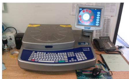
Automated XRF Sulfur Instrument